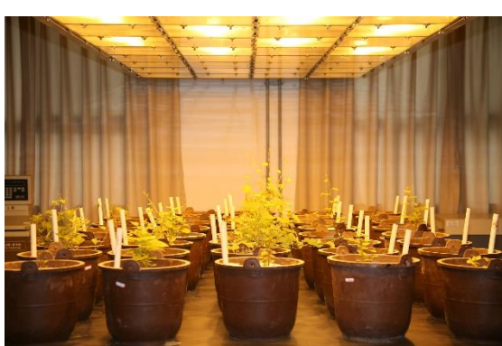
Dryland Agriculture Simulation