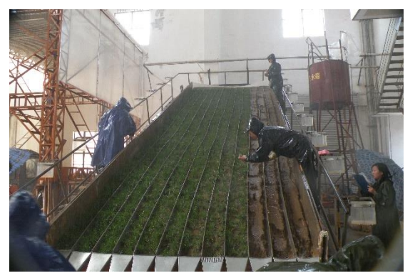
Rainfall Simulation Lab

To effectively simulate soil erosion processes, the ISWC built a huge Rainfall Simulation Lab (approx. 1,300 m<sup>2</sup>), the second largest simulated rainfall lab in the world. There are also Facilities of Dryland Agriculture in the ISWC, equipped with adjustable light, sealed gas and self-controlled glass greenhouses of different sizes.