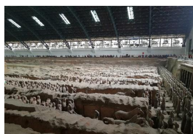
Terra Cotta Warrior