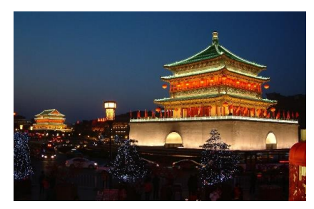
Bell Tower and Drum Tower