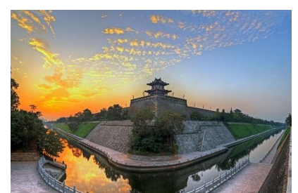
Xi'an City Wall

There are also other cultural landmarks such as the city wall of the Ming Dynasty, the Stele Forest, the two Wild Goose Pagodas and the Bell Tower. In the outskirt of the city, there are also ancient ruins from different dynasties, such as Han City, Tang City, Efang Palace, Weiyang Palace and Daming Palace and Huaqing Pond. In addition, since the region of Xi'an is located between the Loess Plateau and the Qinling Mountains, it also enjoys striking natural landscapes, such as the Mount Hua made of Granite with bright white color and the Qinling Mounts.